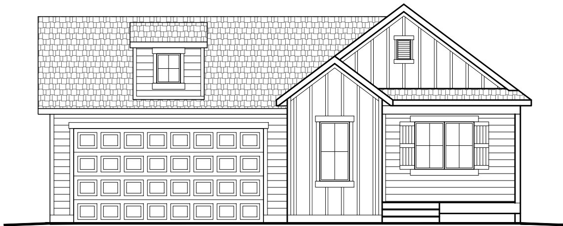
EAGLE LANDING 1220 - FRONT ELEVATION - OPTION C