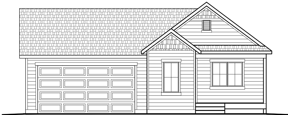
EAGLE LANDING 1220 - FRONT ELEVATION - OPTION A