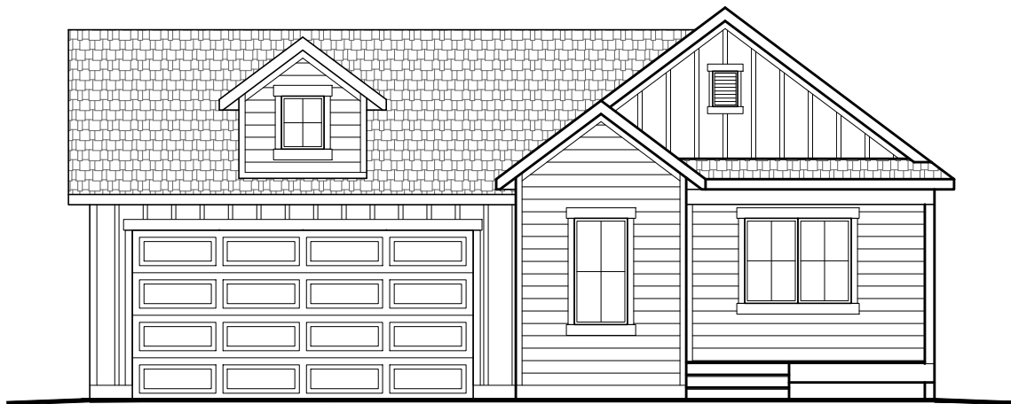
EAGLE LANDING 1220 - FRONT ELEVATION - OPTION B